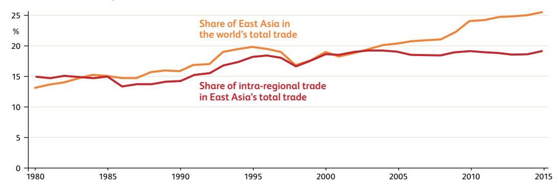
FIGURE 2 THE EAST ASIAN TRADE FOCUS ON THE US AND WESTERN EUROPE